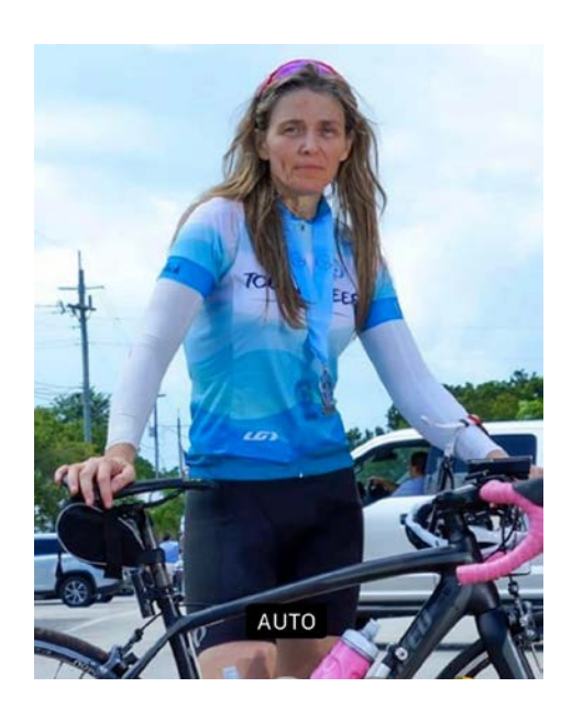
CANDIDATE FOR DIRECTOR AT-LARGE